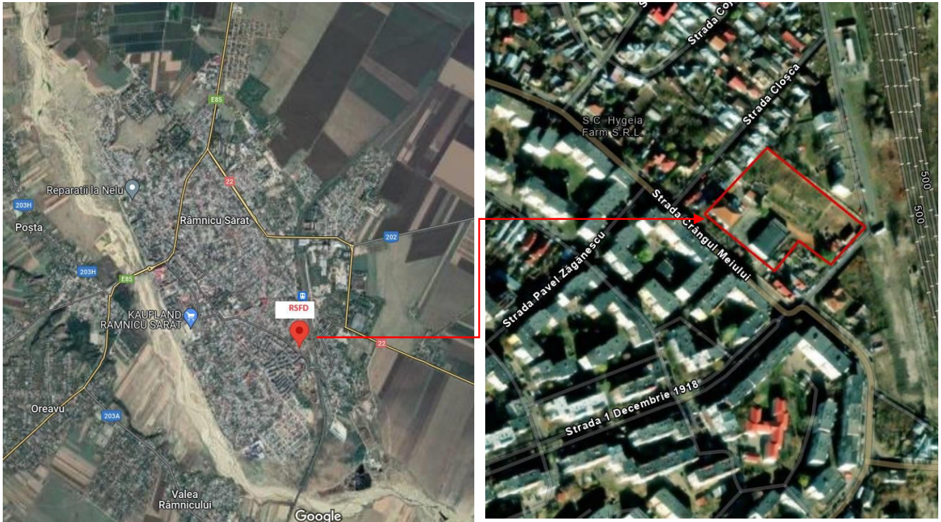
Figure 2 The positioning of RSFD in Râmnicu Sărat Municipality

The building that is the subject of the Râmnicu Sărat investment sub-project is located in Râmnicu Sărat Municipality, Crângul Meiului street no 85, Buzău County and houses the headquarters of the Râmnicu Sărat Fire-Fighting Detachment. The surface of the land on which the building is located measures 7592 sqm.