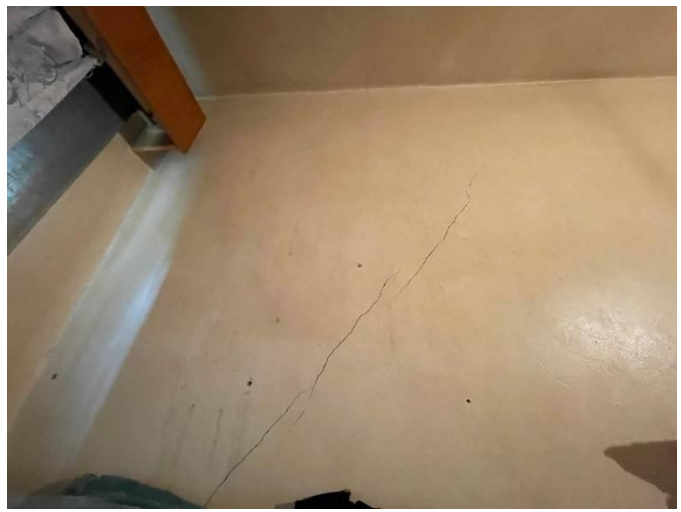
Figure 6 Existing RSFD's C1 administrative building