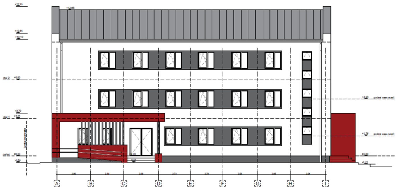
Fig.9 Proposed design of the new building

The objective to be achieved following the investment is to ensure optimal conditions for the daily work of Buzău ESI staff and intervention personnel from the Râmnicu Sărat Firefighting Detachment. At the same time, conditions will be created for the preparation of the population in the area in order to ensure an effective responsibility for different types of risks according to the needs generated by emergency situations.