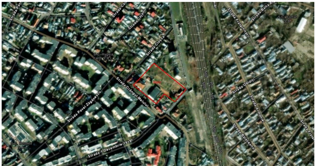
Figure 5 Neighboring area of Râmnicu Sărat Fire-Fighting Detachment

The subunit buildings are situated at approximately 100 m away from the railway lines. Following correspondence with the railway line manager, it has emerged that the work under the Project is not being carried out in the protection zone and no special measures are required.